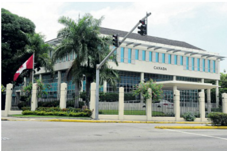
The Canadian High Commission in Kingston. (File photo)

KINGSTON, Jamaica – The Government of Canada is spending more than CA$95,000 to assist Jamaica in implementing disaster risk reduction projects.